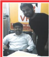
AYUSH SINHA IAS 2017