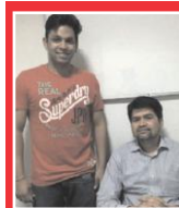
ANSHUL SINGH IAS 2017