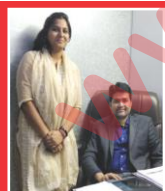
ABHILASHA ABHINAV IAS 2017