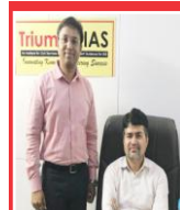
TEJAS N. PAWAR IAS 2017