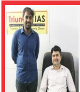
KOYA SREE HARSHA IAS 2017